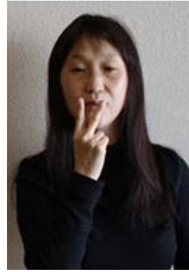
Smo e king

Ma e k your o e n 'No e Smo e king' po e ster.