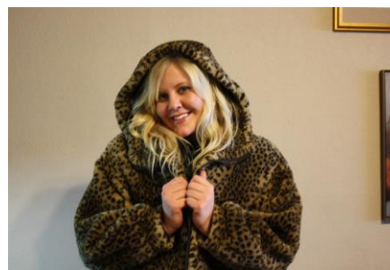
Fur coat. Fer koet.