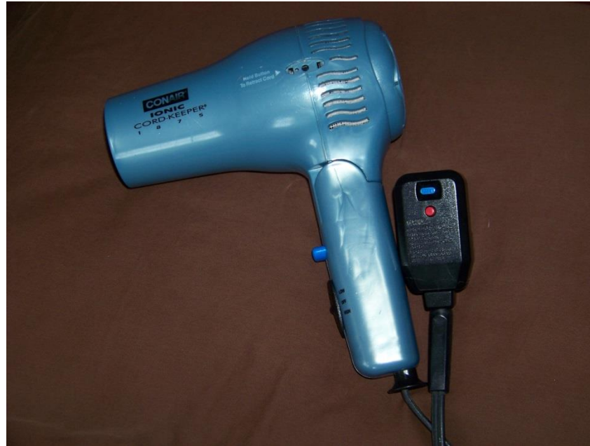
hair drier haer drieer